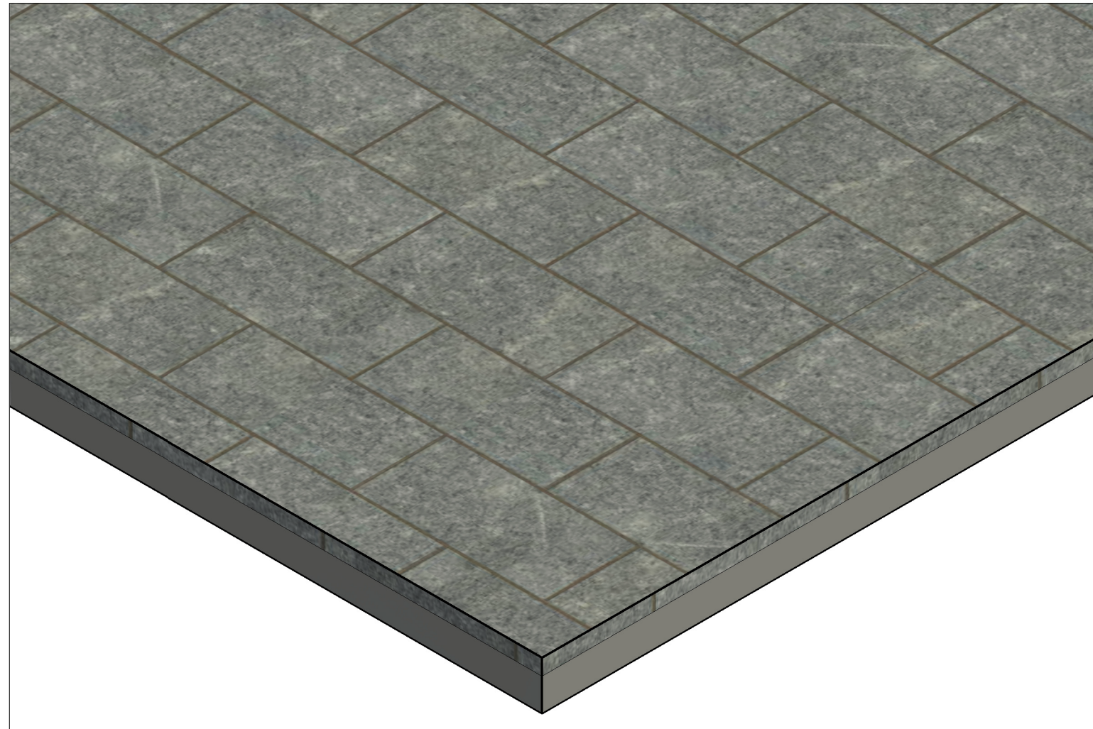
POLYCOR STONE PAVER - 2" THICK

With full control over the paver supply chain process from quarry to delivery, Polycor is leading the industry with the shortest lead times and the widest range of stone and finish options.