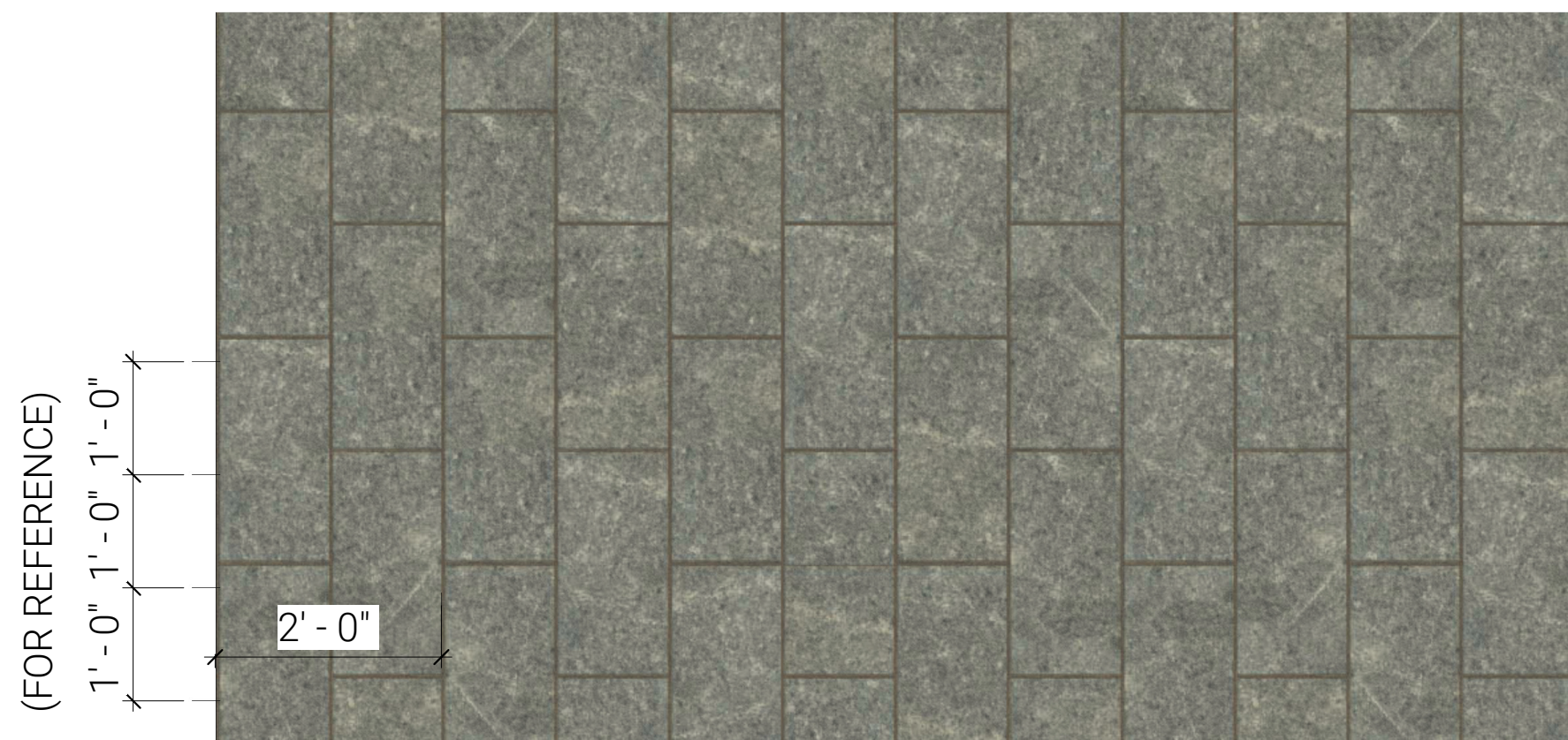
SAINT HENRY BLACK™ GRANITE - 12 x 24 Half Running Bond