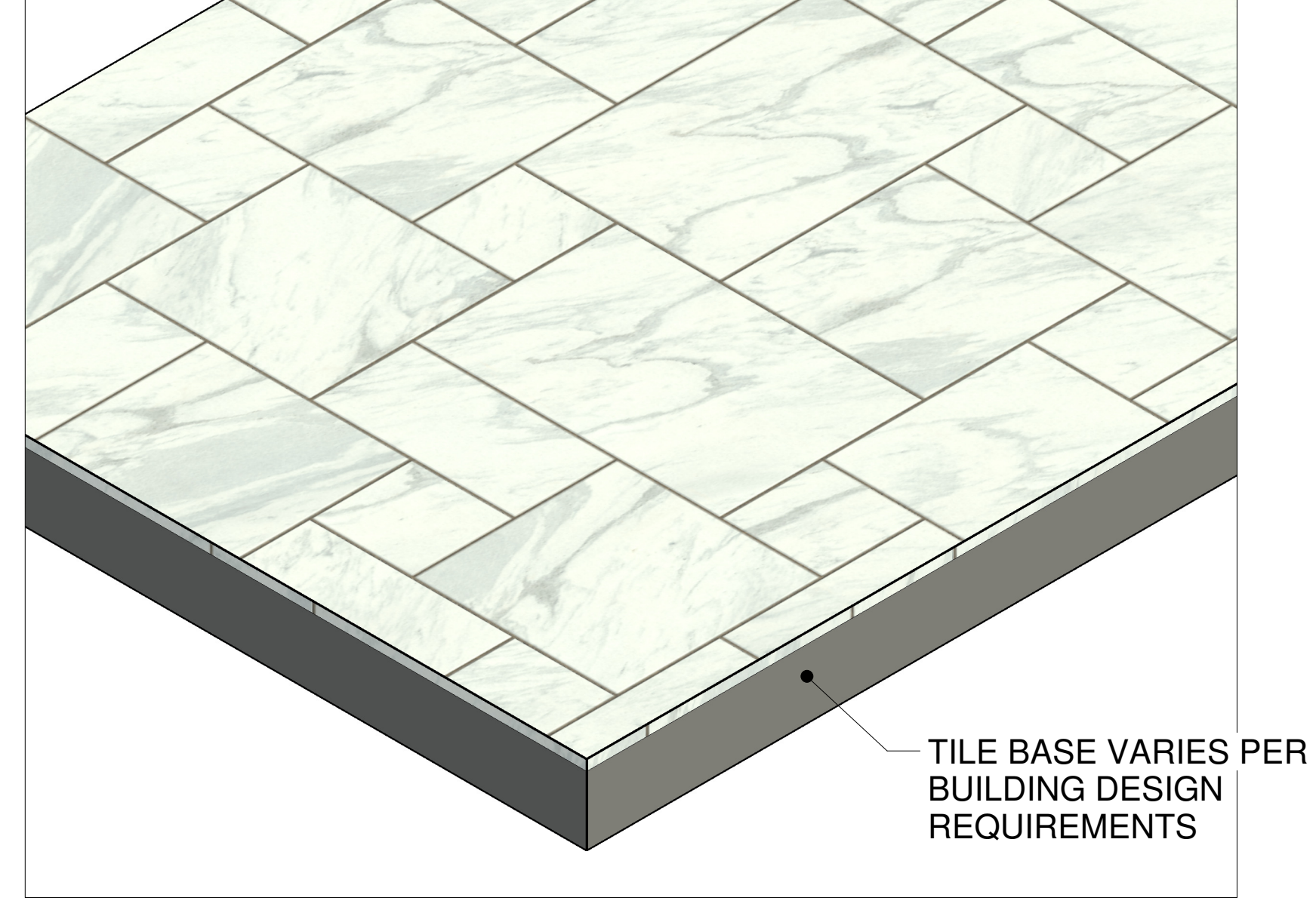
POLYCOR STONE FLOOR TILE - 1 1/4" THICK

Polycor commercial stone flooring materials come in a variety of colors, finishes and patterns and are sure to enhance whatever project or application you have in mind.