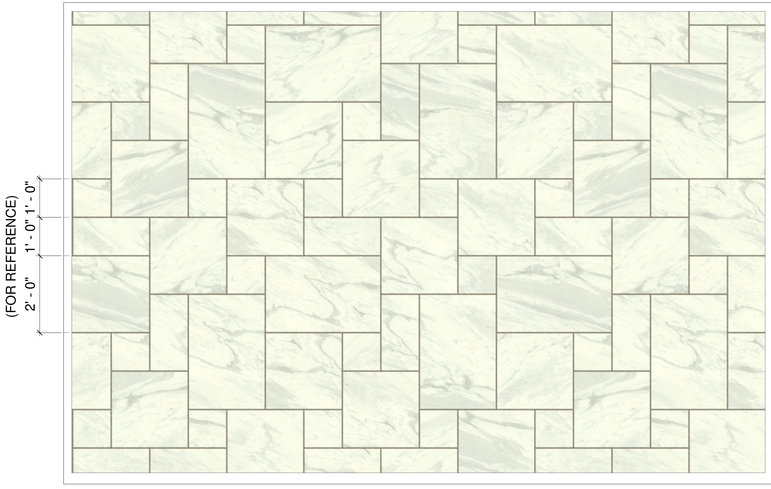
GEORGIA MARBLE™ - PEARL GREY - BILTMORE PATTERN