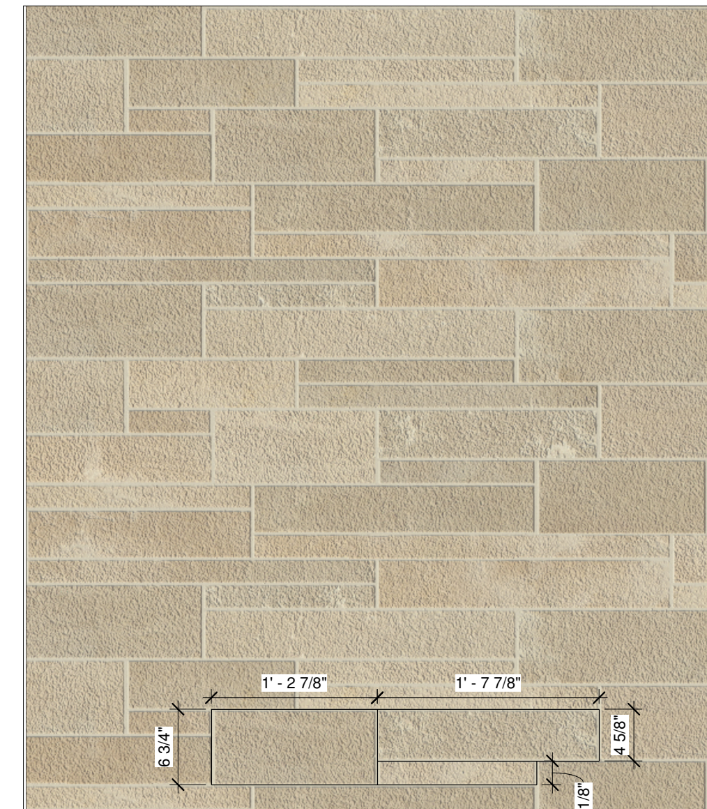
(DIMENSIONS PROVIDED FOR REFERENCE)