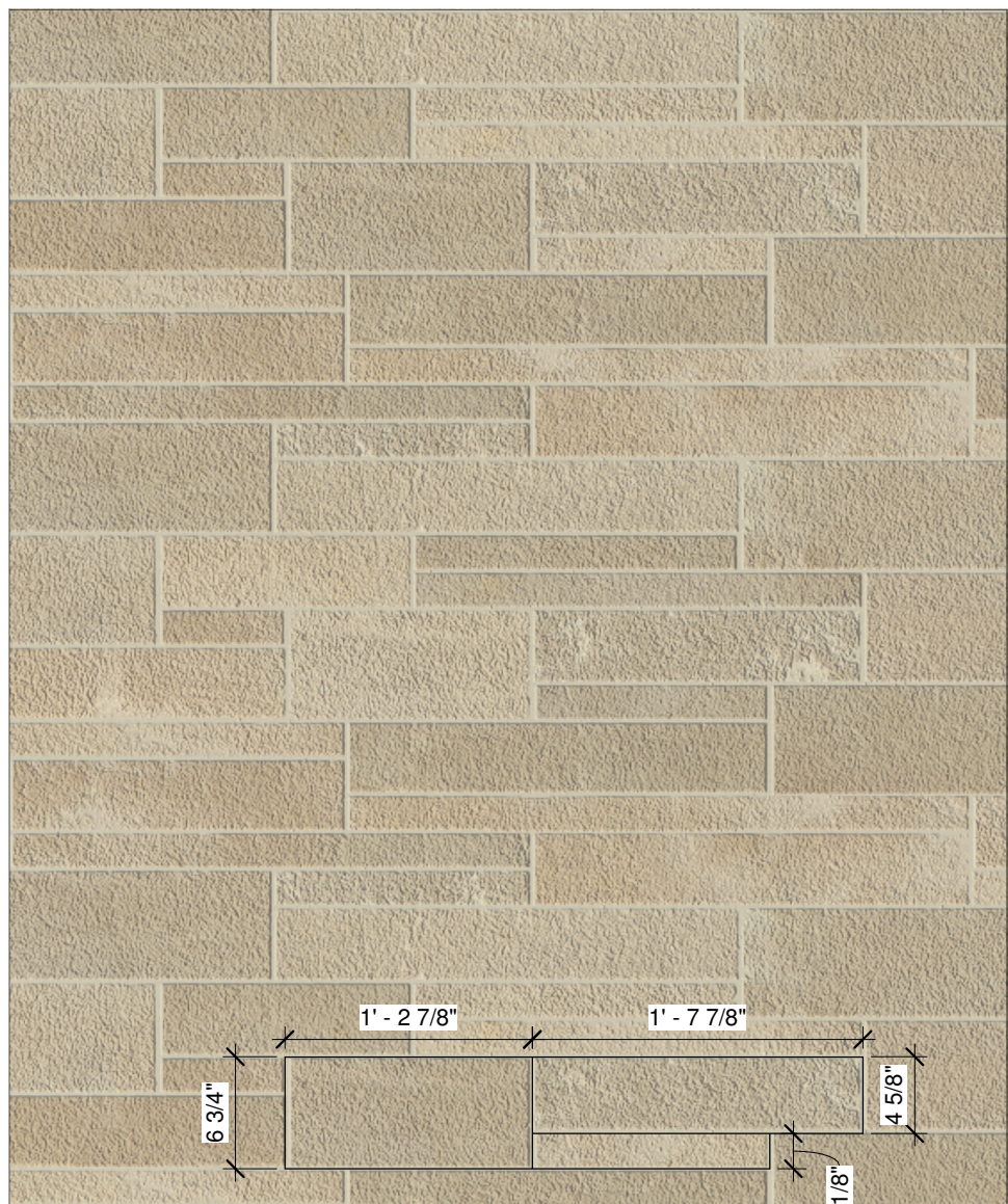
(DIMENSIONS PROVIDED FOR REFERENCE)

Berkshire™ is a solid, split-face veneer. Variations in height create a classic, pleasant, and seemingly random definition for commercial and fine residential structures. Available in Thin veneer - 1" thick and Full-Bed veneer - 3 5/8" thick. Pallet of mixed sizes available. L-shaped corner pieces are available for Thin veneer.