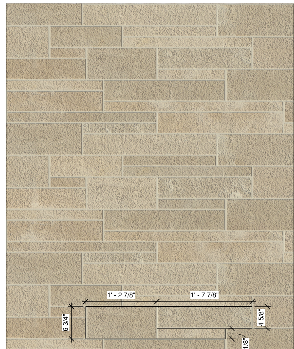
(DIMENSIONS PROVIDED FOR REFERENCE)

Berkshire™ is a solid, split-face veneer. Variations in height create a classic, pleasant, and seemingly random definition for commercial and fine residential structures. Available in Thin veneer - 1" thick and Full-Bed veneer - 3 5/8" thick. Pallet of mixed sizes available. L-shaped corner pieces are available for Thin veneer.