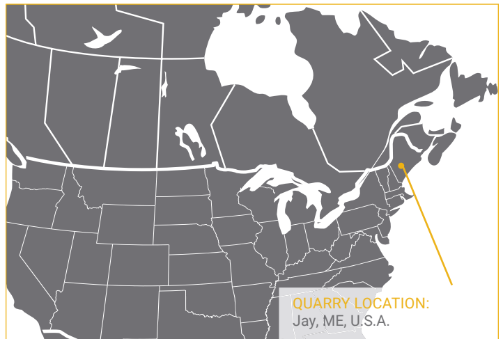
QUARRY LOCATION: Jay, ME, U.S.A.