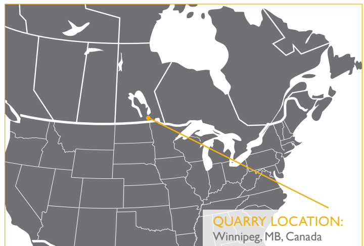
QUARRY LOCATION: Winnipeg, MB, Canada